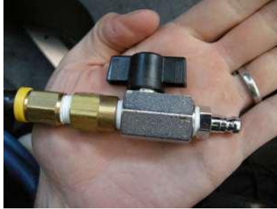
Figure 5: Sample diluent Q/D subassembly.