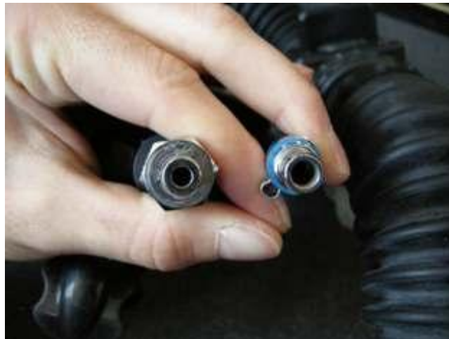
Figure 3: Ocean Reef (left) and CEJN 221 (right) nipples with large bores suitable for supplying breathing gas.

A final advantage to CEJN style fittings, is that they can be used throughout your rig including offboard whips, at manual add valves, and for BC/suit inflation. This consistency used throughout the rebreather gas distribution configuration makes it possible to access any gas supplies at any point in your equipment – which eliminates confusion and anxiety in addressing any number of failure modes. This also allows for full bypass of the rig itself to directly feed the BOV in a full boom scenario.