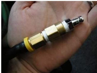
Figure 6: Oxygen Q/D subassembly.

In general, the male oxygen whip assembly should consist of a CEJN-style nipple, and a check valve/non-return valve - only permitting flow into this hose (figure 4). This assembly prevents the onboard gas supply from escaping the whip, and keeps water out of the system when not plugged in. No ball/isolator is used, as there is no risk of using the 'wrong' gas. It's all oxygen. This male assembly is affixed to a LP hose and installed at either the diluent first stage LP port of the onboard oxygen supply, in which case the oxygen first stage serves as your oxygen manifold – OR - to the oxygen manifold in the unit if there is one. In either case, the system is plumbed such that all devices (solenoid, orifice, needle manual add valve, etc) on the rig are fed by the same oxygen supply, either onboard or offboard.