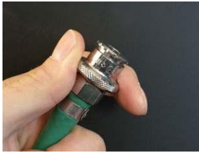
Figure 1: female CEJN 221 fitting.

The original, and very simple advantage, stemming from use on drysuits, is the ease of connecting and disconnecting the fittings, even while under pressure, and with heavy gloves on.